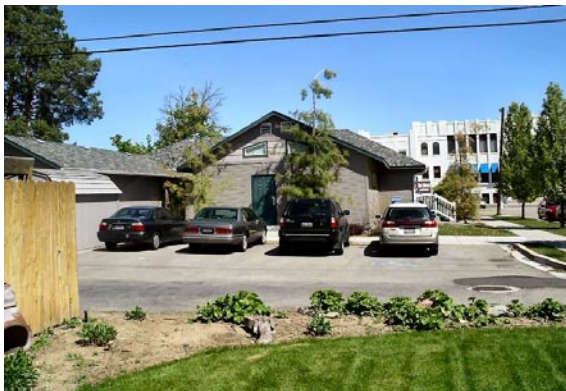
Parking area in rear of building